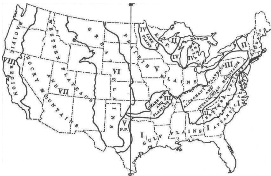
FIGURE I THE FAR WEST